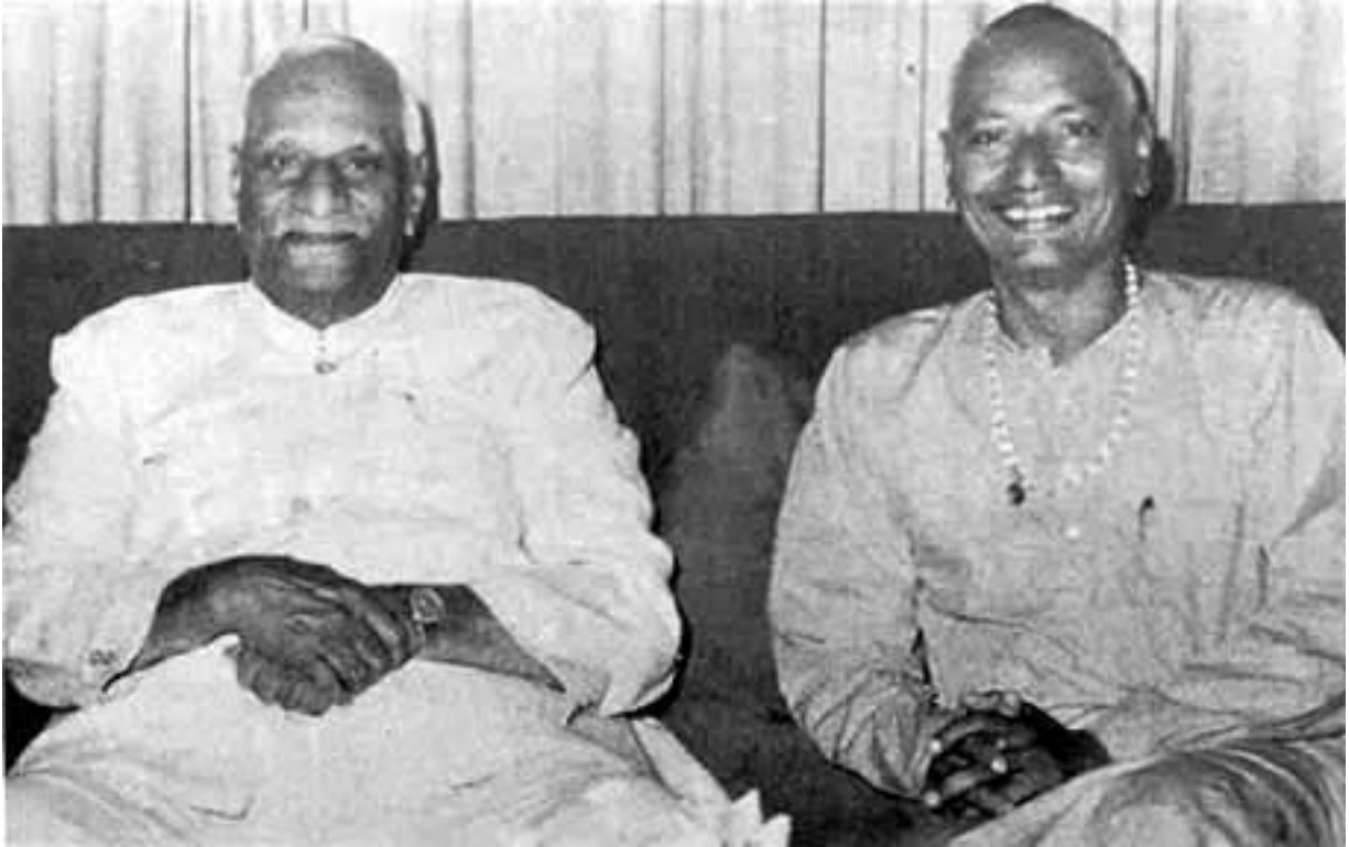
Mr. V.V. Giri, President of India