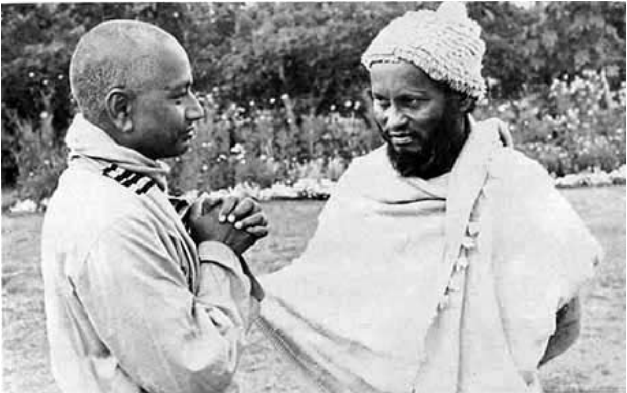
Swami Muktananda Paramahansa