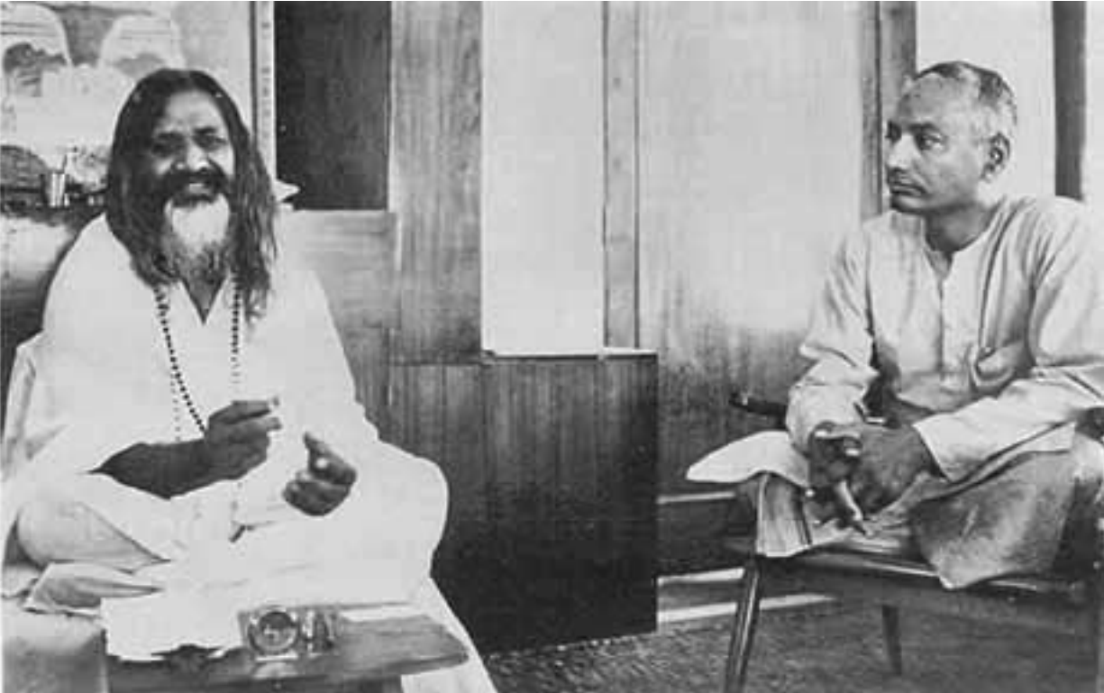
Maharshi Mahesh Yogi