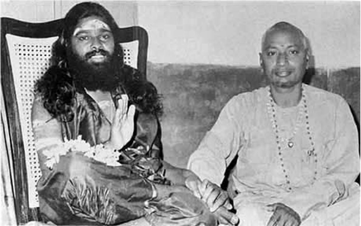
Swami Satchidananda of Mysore