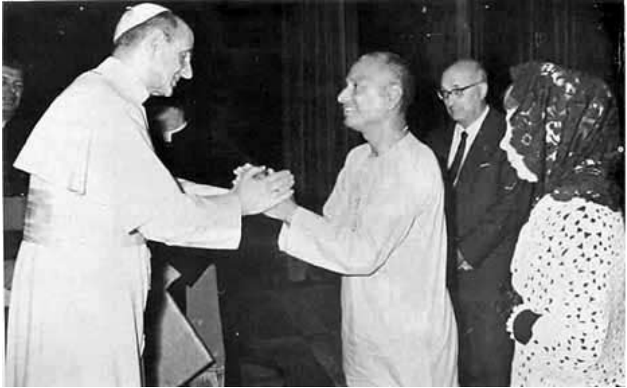
H.H. Pope Paul VI